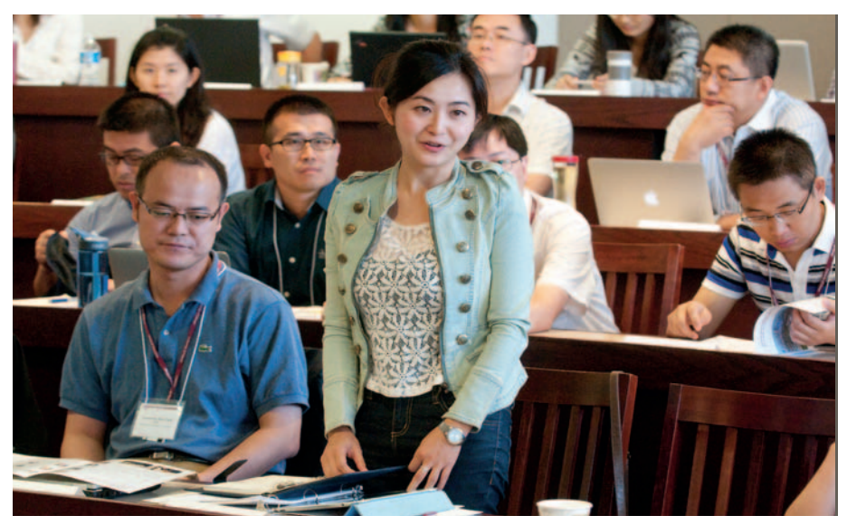
Scholars are encouraged to actively participate in class discussions.

Yale and is the Law School's inaugural Sidley Austin Professor of Law.