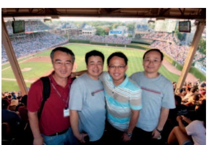
Social events, such as a visit to the historic Chicago baseball stadium, Wrigley Field, were a highlight of the 2012 Summer School

The Summer School in Law and Economics offers scholars opportunities to explore Chicago, one of the world's great cities, and to experience some of our traditions while building relationships with talented scholars from throughout the region. Planned social events enhance the Summer School experience, and they leave plenty of time for participants to explore Chicago on their own.